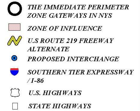
MAP II - 1